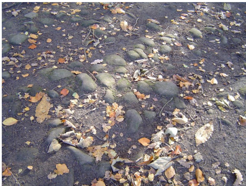
Surface cobble stones in Roundhay Park on the footpath south of the Golf Course/Castle Wood boundary wall

The coarse lithology of the Roundhay Park cobbles suggests that they probably came from the south side of the Wharfe valley between Otley and Addingham where similar coarse-grained sandstones of the Addingham Edge Grit form the crags.