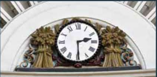
Inside the Corn Exchange